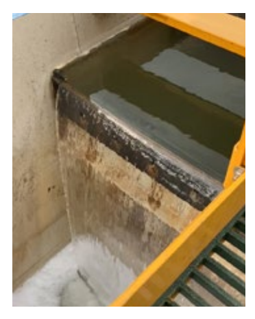
Monroe X-Flo Mobile Clarifier™ for treatment of wastewater (produced water, drilling mud, etc.) from oil and gas hydraulic fracking operations. System provided TSS removal and oil/water separation for 300 GPM flow.