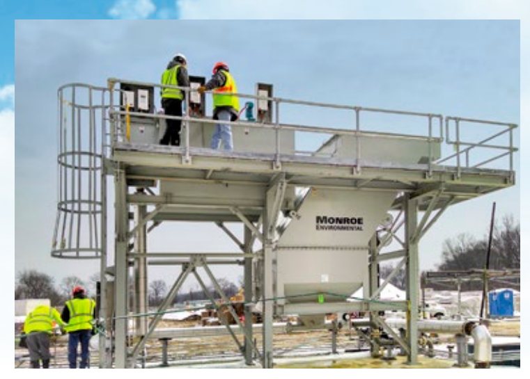
150 GPM Vertical Plate Clarifier to treat disc filter backwash at natural gas power station. System included clarifier, chemical mix tanks, access platform, ladder, and support structure.