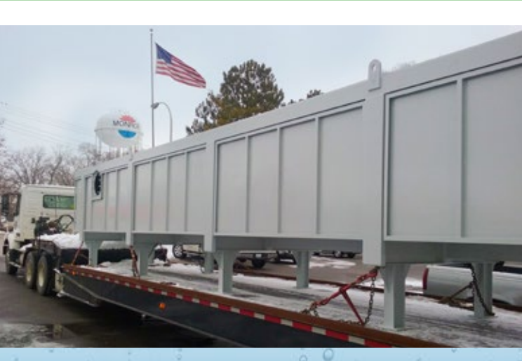
at a biorefinery. The system included a chain and flight conveyor and oil roll + pipe skimmer for oil removal. The separator is designed to remove free solids and oil