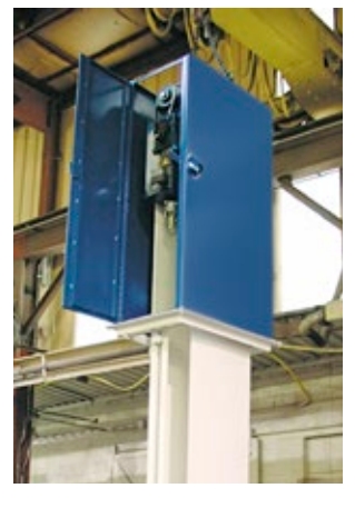
Monroe belt skimmer Oil Recovery Unit for oil removal from wastewater holding basin at a large coal-fired power plant. The belt retrieved oil from tanks approx. 20 ft. below the mounting surface.