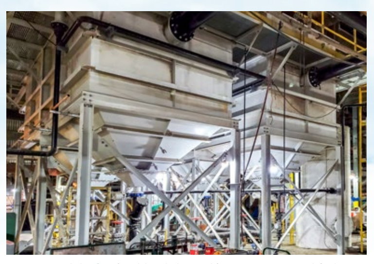
Two Horizontal Clarifiers for solids and oil removal from stormwater at a coal-fired power plant. Scope included clarifiers with bolted steel covers, flocculation tank with mixer, skimmed oil storage tanks, and access platform. Clarifiers were rated for 600 GPM each.