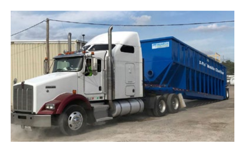
X-Flo Mobile Clarifier™ deployed for temporary treatment of produced water at a fracking well. The X-Flo Clarifier replaced multiple weir tanks with a single unit and outperformed other separators.