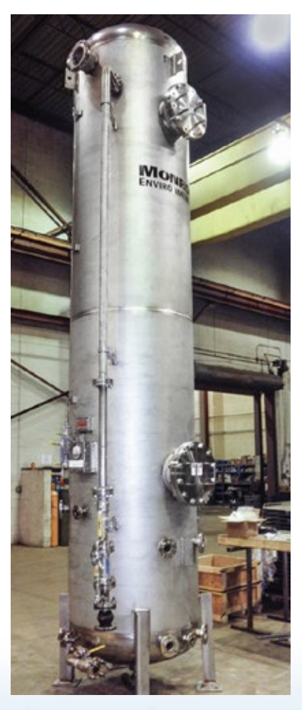
1,500 ACFM Packed Tower Scrubber to remove H<sub>2</sub>S from syngas conversion process at a biodiesel plant. Unit was built and stamped to ASME VIII code; 316L SS construction.

420 GPM API Separator for wastewater treatment