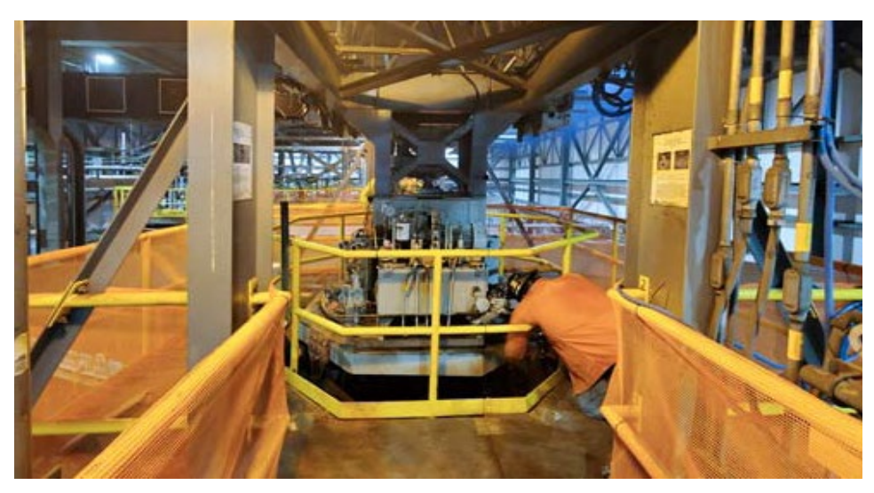
Clarifier drive rebuild for FGD recycle clarifiers at a power plant. The solids contact clarifier drives (non-Monroe unit) were misaligned and wearing rapidly. The drive rebuild prevented a possible emergency shutdown if they had failed.