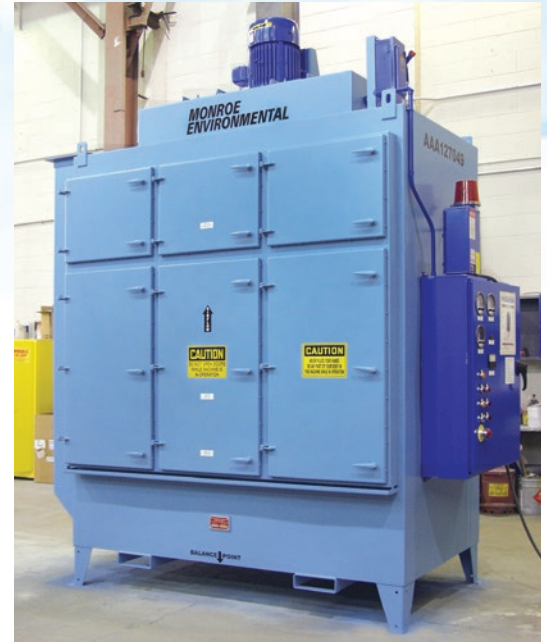
Left: Machining exhaust using Multi-Stage Mist Collector media filtration, Right: 7,000 CFM Multi-Stage Mist Collector during final assembly at Monroe shop

The Monroe Environmental ® Multi-Stage Mist Collector is designed to collect and remove airborne oil, mist, smoke, and sub-micron vapors generated by operations such as high production machining and cold forming. It is a multiple stage collector that has proven capabilities exceeding 99% efficiency on many installations.