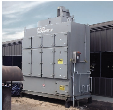
8,000 CFM Multi-Stage Mist Collector