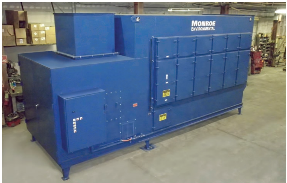
25,000 CFM Multi-Stage Mist Collector with integral fan housing.

Monroe Multi-Stage Mist Collectors are available in various configurations to meet your needs. Units can be suspended from the ceiling or other supporting structures to conserve floor space.