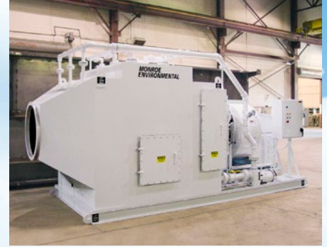
12,000 ACFM Packed Bed Scrubber to exhaust odor and fumes from sauce cooking kettles.