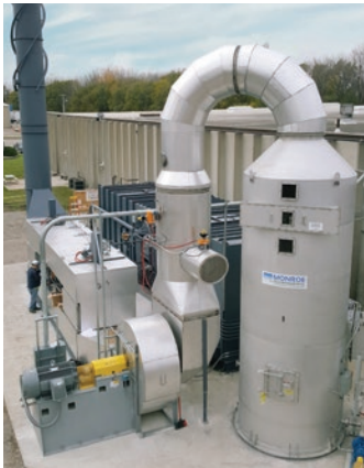
Monroe Multi-Stage Scrubbing System with Venturi Scrubber and Cyclonic Separator to remove particulate from food dryer exhaust prior to VOC destruction with a regenerative thermal oxidizer.