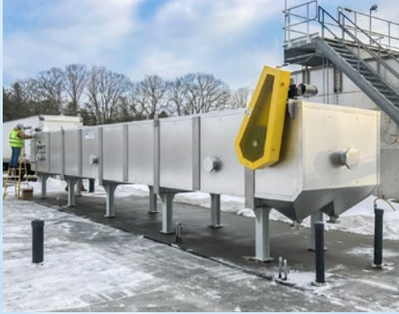
API Separator improves oil removal for snack chip production facility wastewater.