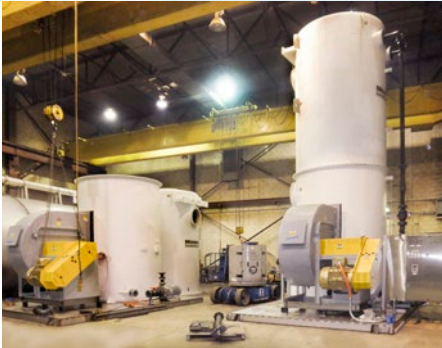
Liming drum exhaust scrubbing – H 2 S neutralization and fume control at a tannery. Dual 20,000 ACFM Packed Tower Scrubbers, FRP construction.