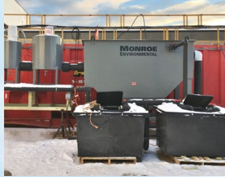
50 GPM Horizontal Clarifier rental pilot system for meat production facility wastewater.