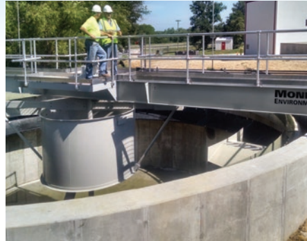
Circular Clarifier rebuild for wastewater treatment at a soft drink bottling facility. The internal mechanism, bridge, and drive were replaced in the 42 ft. diameter unit.