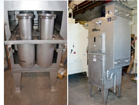
1,000 ACFM Spiral Tube Mist Collectors for mist collection from cheese mold wash-down/cleaning process. The spiral tubes provide a high level of mist agglomeration and removal without using filters.