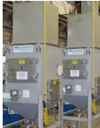
2,000 ACFM Dual Throat Venturi Scrubbers , 304 SS construction for particulate collection from marshmallow powdered sugar coating operation.