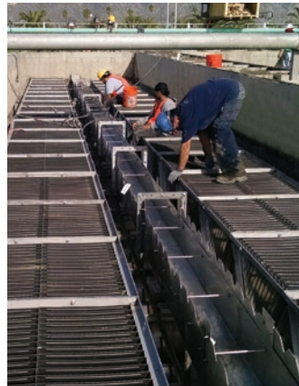
Plate Settler for enhanced separation of solids in a wastewater digester at a brewery. The unit was constructed from 304 SS and has 120 modules.