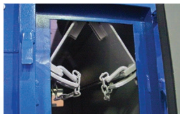
Adjustable scrubbing throats