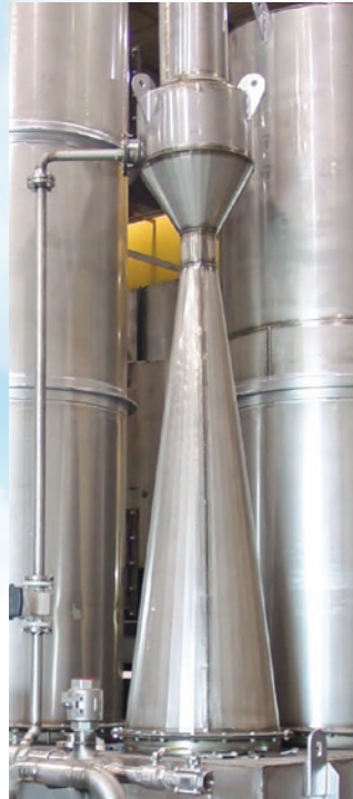
High pressure drop 80 in. W.C. fixed throat Venturi