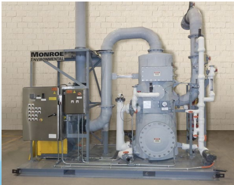
Venturi Scrubber, FRP construction with separation section, integral recirculation reservoir, exhaust fan, stack, and controls.