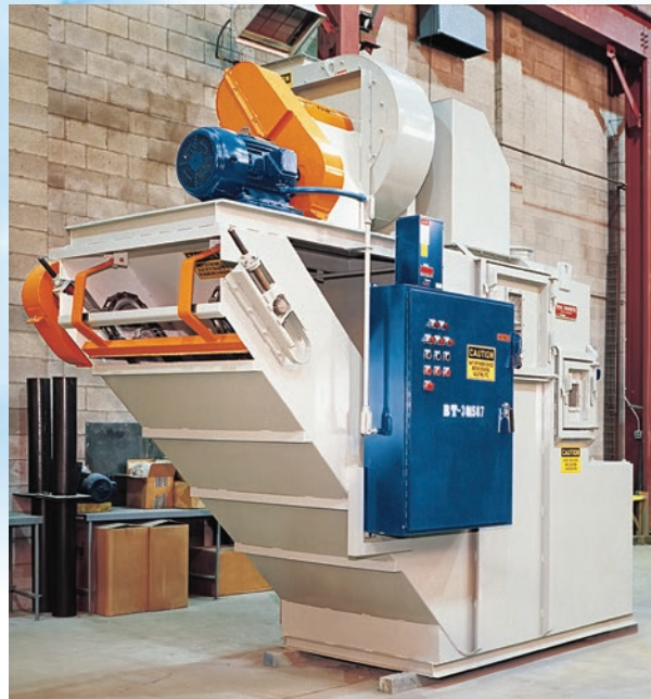
5,000 CFM Dual Throat Wet Air Scrubber