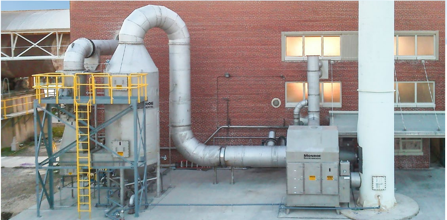
Monroe Venturi Scrubber and Cyclonic Separator exhausting a lime kiln

Monroe Environmental® Venturi Scrubbers are designed to remove both heavy and light airborne particulate matter from exhaust systems, as well as flue and process gasses. Venturi Scrubbers bring particulate-laden air streams together with water at high velocities to transfer the particulate into the water stream. The water droplets and particulates are then removed from the air stream through centrifugal separation and mist elimination stages.