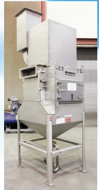
2,800 CFM Dual Throat Wet Air Scrubber, stainless steel construction