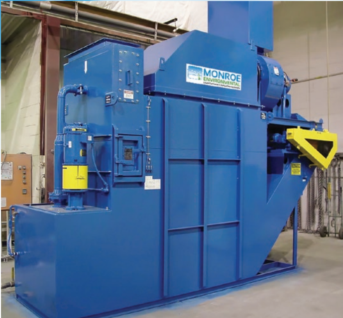
9,600 CFM Dual Throat Venturi Scrubber for boiler exhaust scrubbing