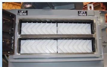
Chevron mist eliminator