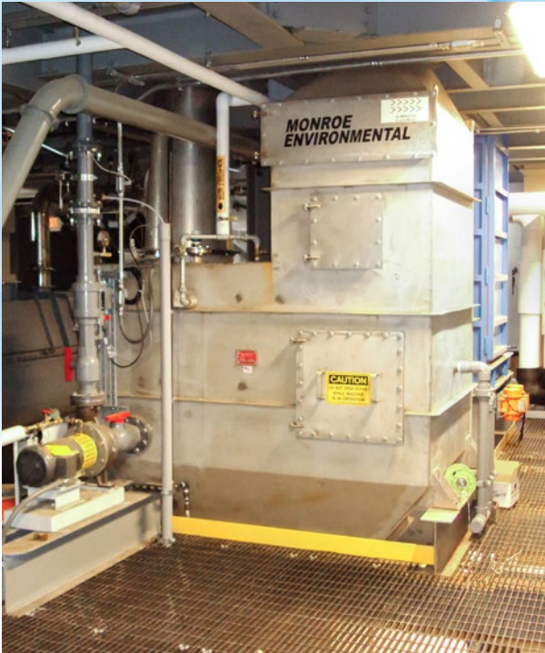
Venturi Scrubber for frac sand/proppant dust