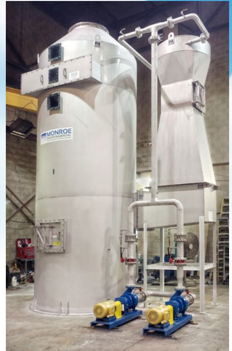
Venturi Scrubber and Cyclonic Separator for PM removal from dryer off-gas prior to RTO.