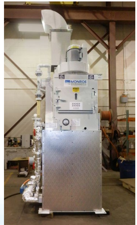
Explosive dust collection for a plastic manufacturing process: 3,500 ACFM Dual Throat Venturi Wet Scrubber unit in Monroe's shop before shipment. The system reservoir included heat traced piping, an electric immersion heater element, and was insulated and clad for protection during winter month operations.