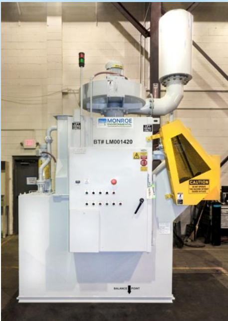
Dual Throat Venturi Scrubber with particulate reclamation system