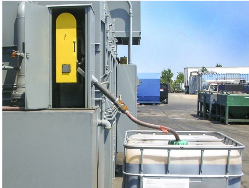
Monroe Oil Skimmer continuously filling a 275 gallon storage tote.