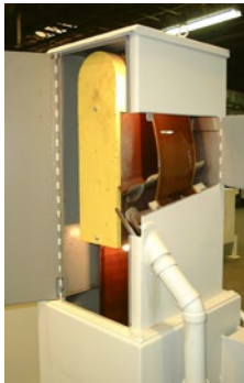
Model 8A Oil Recovery Unit with 8 inch wide belt

The Monroe Oil Recovery Unit operates unattended in any area of tranquil oil accumulation. It will continuously recover floating oil in a condition that permits disposal or reclaiming for other industrial purposes.