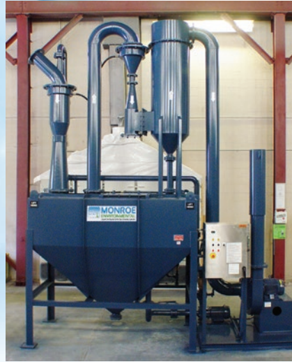
Left: 1,000 CFM Scrubbing System to remove lime dust from a chemical manufacturing process. (From left): Ejector Venturi, liquid clarification tank, high energy Venturi Scrubber, and cyclonic separator. The unit was designed to achieve 95% efficiency on 0.5 micron particles