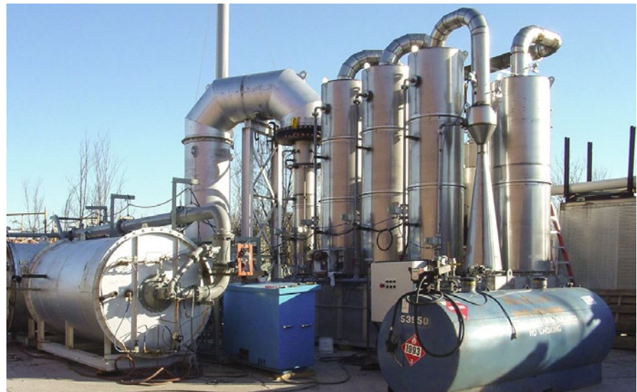
Below: Multi-Stage Scrubbing system with inlet quench, 3-stage Packed Bed Scrubber, high energy Venturi Scrubber, liquid chiller/condenser, gas reheater, PAC injection system, baghouse, and Carbon Adsorber for toxic gas incineration