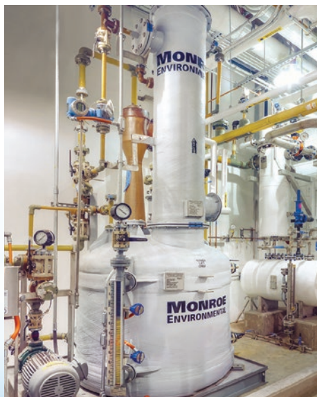
Two-stage wet scrubbing system with eductor venturi and packed tower for HCl and SO 2 reduction from pharmaceutical manufacturing process exhaust