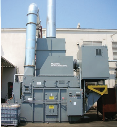
15,000 CFM Scrubbing System to condense and reclaim vaporized grease and remove hydrocarbon fumes from a chemical manufacturing process. The system includes a Dual Throat Venturi Scrubber with drag conveyor, Oil Recovery Unit, and Packed Bed Scrubber for odor control.

Contaminants formed in these processes are frequently highly corrosive, hazardous, and/or difficult to remove. Removal often requires process temperatures at 1,500°F and higher. Through proper quenching and gas conditioning techniques, Monroe can provide reclamation of costly chemicals and compounds contained within the off-gasses.