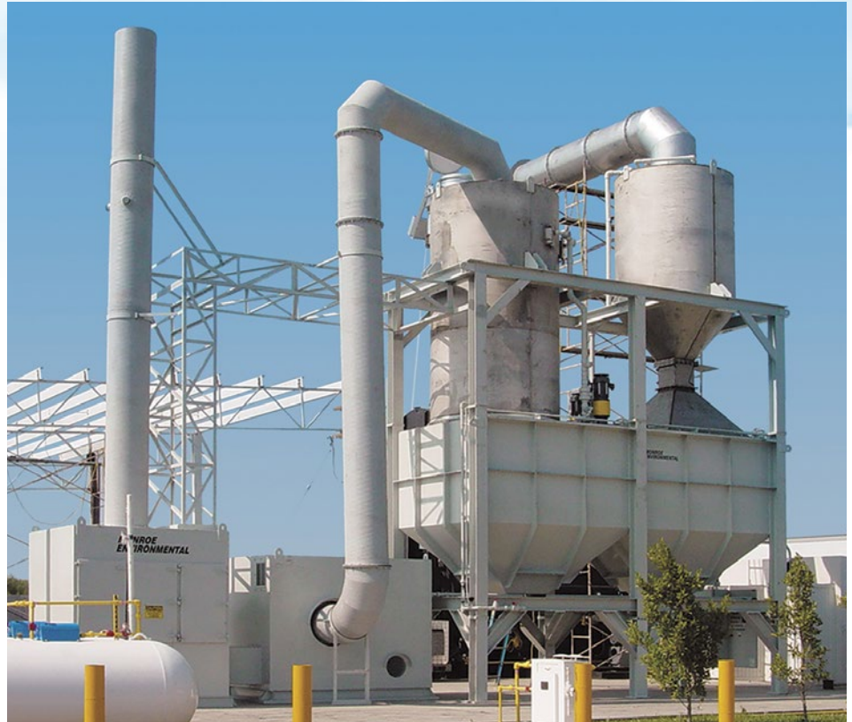
20,000 CFM Multi-Stage Scrubbing System for solid waste incineration process. (From right): Ceramic-lined inlet duct, rapid water quench, adjustable Venturi Scrubber, liquid clarification tanks, Packed Bed Scrubber, and Carbon Adsorber.

Monroe Environmental provides gas scrubbing systems for thermal processes including incineration, oxidation, flame laminating, glass coating, dryers, boilers, and others.