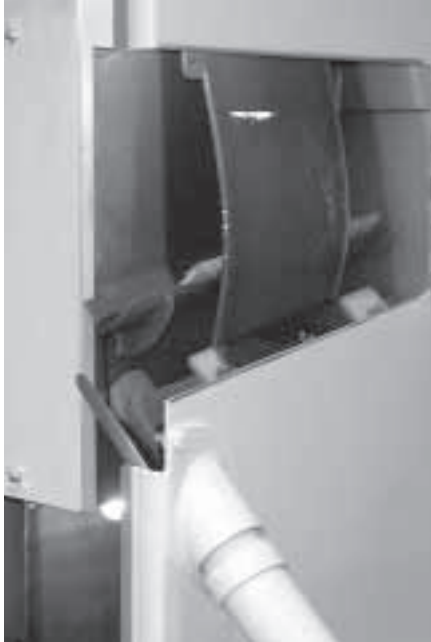
Self-adjusting wipers and oil removal from both sides of belt.

assembly is self-adjusting to compensate for wear. Constant pressure and alignment with the belt are assured.