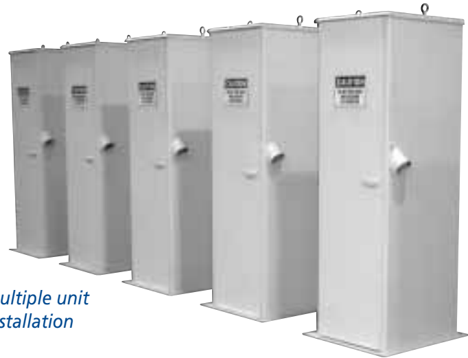
Multiple unit installation