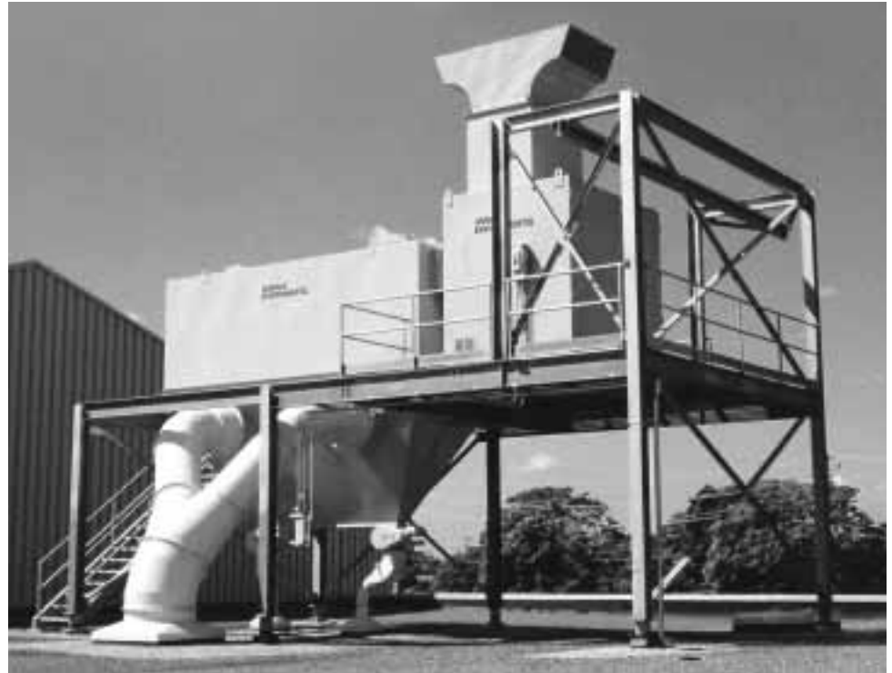
Monroe 20,000 CFM Dust Collector – Roof Mounted