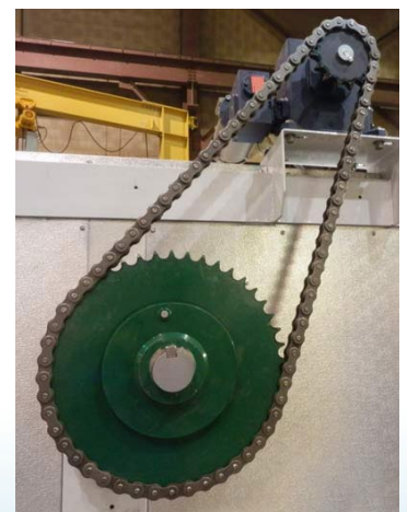
Drive and drive chain during shop testing