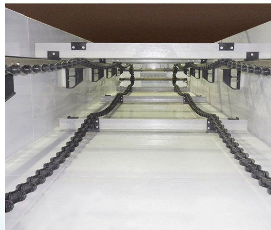
Chain and flight collector with non-metallic chain, flights, wear shoes, and flight supports.