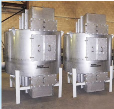
Deep Bed Carbon Adsorber with stainless steel housing