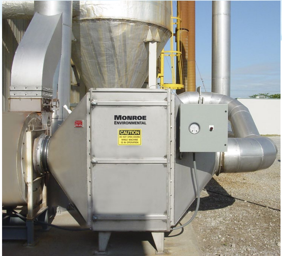
8,000 CFM Carbon Tray Adsorber for a recycling facility, shop assembled with stainless steel housing and differential pressure gauge

Industrial emissions from: degreasing, paint spraying, paper coating, plastic film coating, metal foil coating, rubber-coating, semiconductor manufacture, and printing