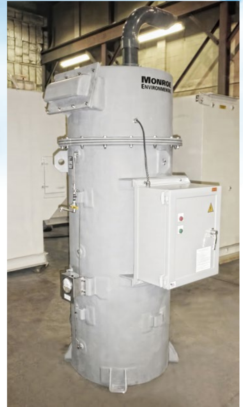
200 CFM Carbon Adsorber, FRP construction, with control panel for H 2 S removal at a municipal lift station