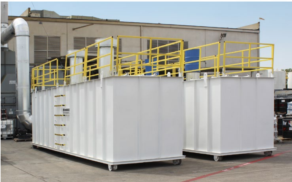
(2) 15,000 CFM Deep Bed Carbon Adsorbers, mild steel construction with specialty exhaust stacks for odor control at a grease manufacturing facility

Monroe Dry Adsorption units provide highly efficient, continuous odor and pollutant removal with a minimal footprint.