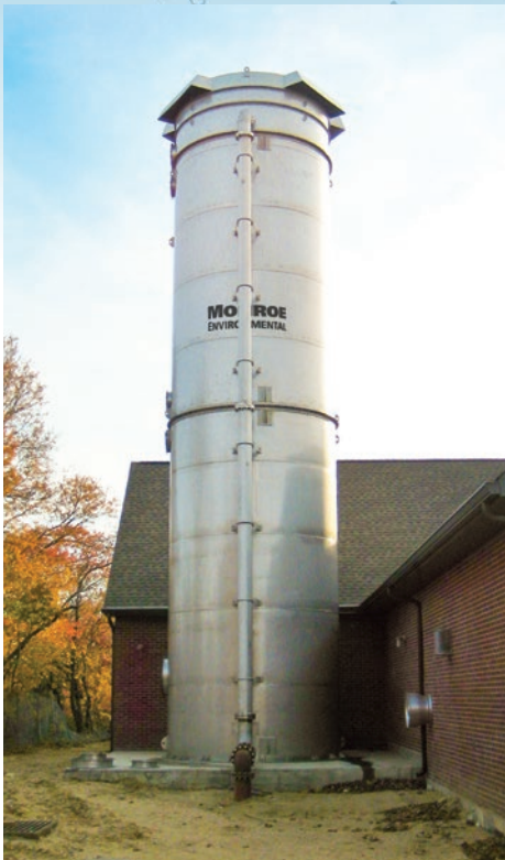
1,400 GPM Air Stripping Tower installed at a water treatment plant