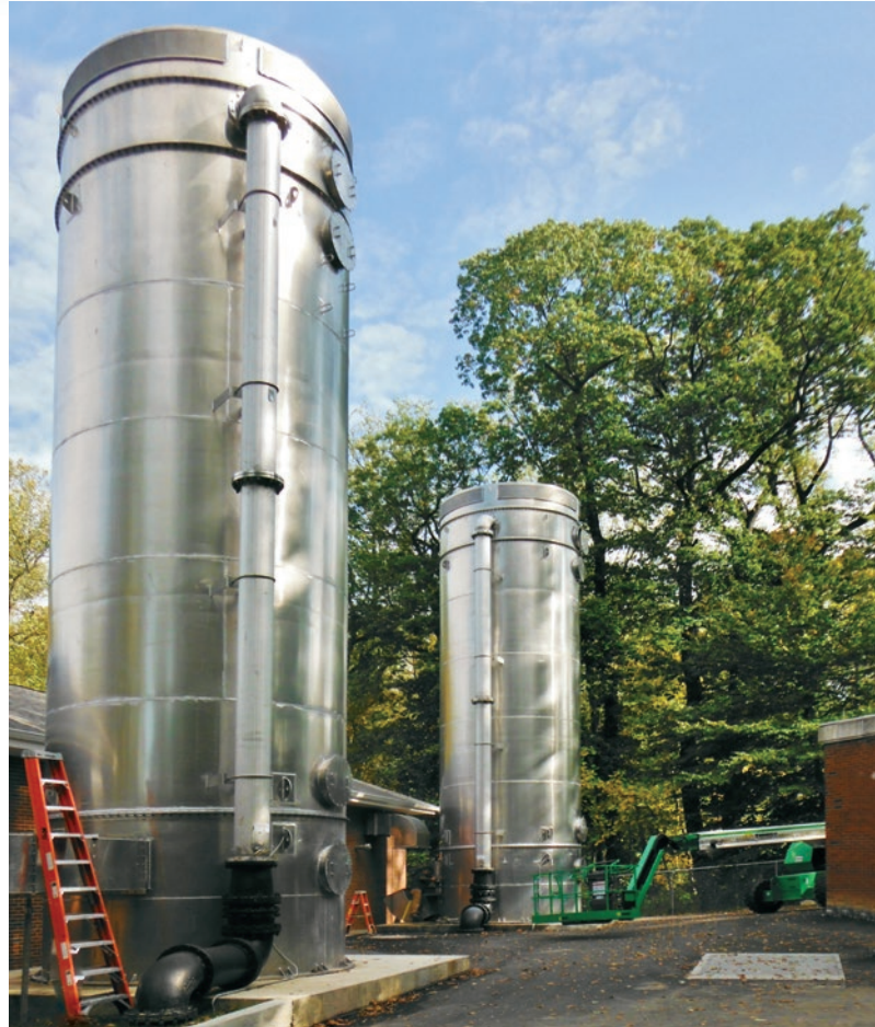
Air Stripping Towers installed at a water treatment plant