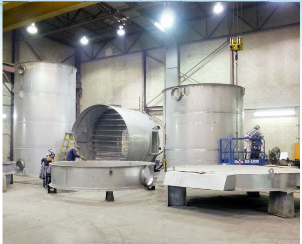
Air Stripper during fabrication at Monroe plant