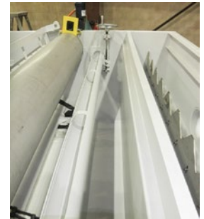
Left: (From left): Diffusion chamber with reaction jet baffles, screw conveyor for solids removal, and chain and flight drag conveyor. Middle: Chain and flight surface skimmer and drag conveyor in separation and settling zone. Right: (From left): Automated oil roll, adjustable pipe skimmer, underflow baffle, and adjustable overflow weir.

parallel plate packs can be added to existing API Separators to increase the effective surface area which will provide increased oil removal and increased wastewater flow capacity.